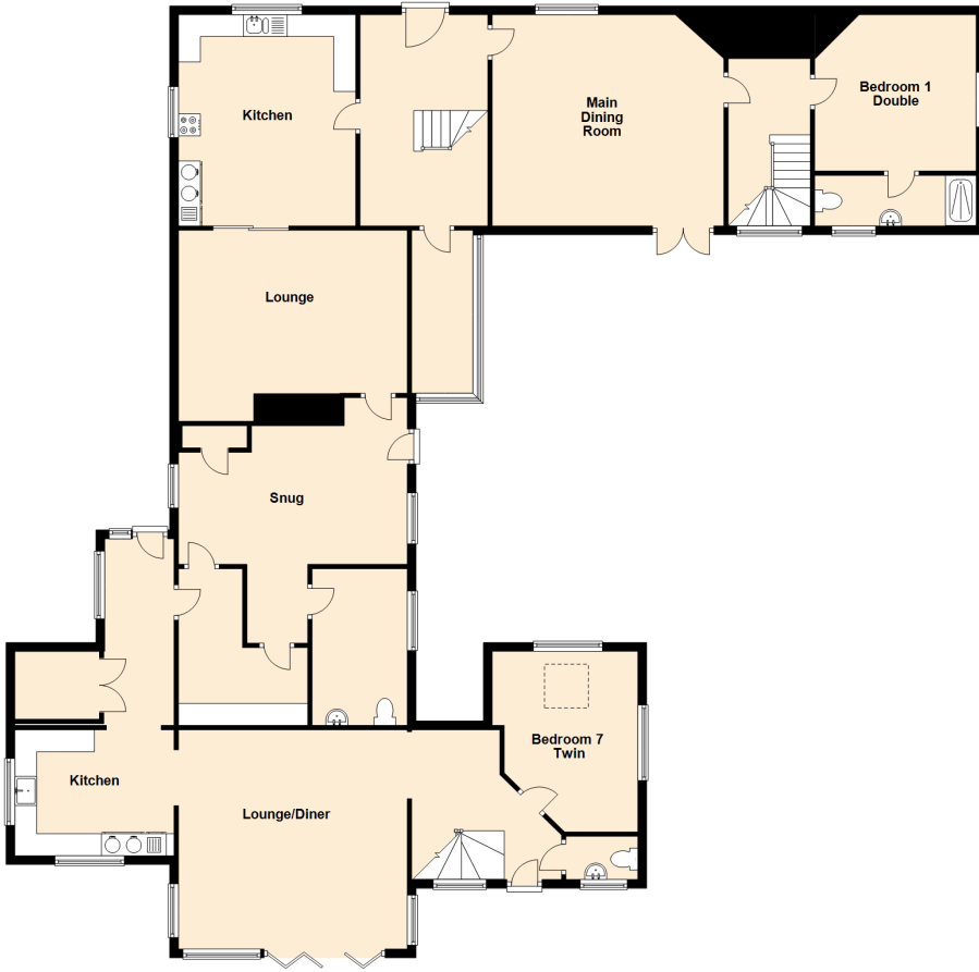
Ground Floor Approx. 224.8 sq. metres (2419.8 sq. feet)